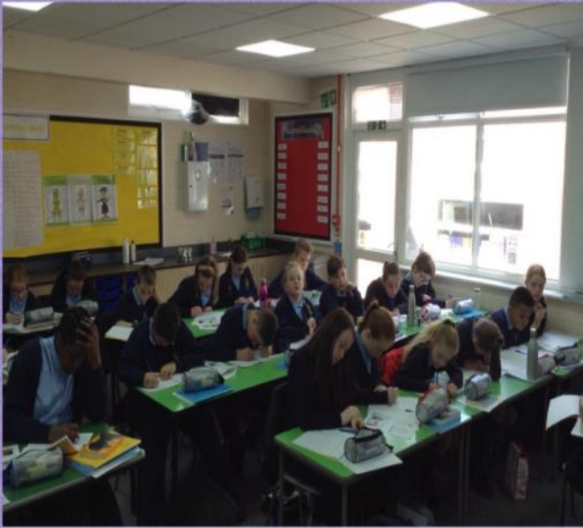
Year 5/6 have been working incredibly hard in their first week back!