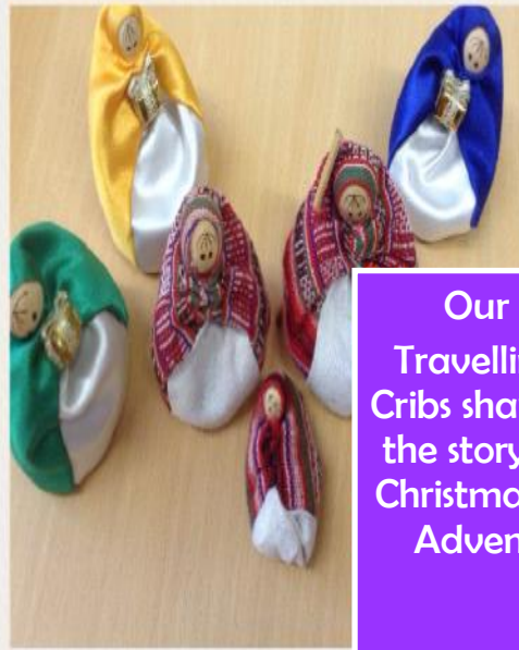
Our Travelling Cribs sharing the story of Christmas in Advent