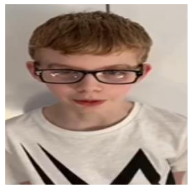
Congratulations, Year 6!

We are so proud of each and every one of you! Thanks to your parents for all their support this year!