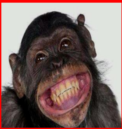
My Friday face