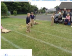
Reception and afternoon nursery had great fun at our sports day