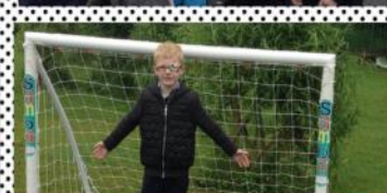
WE SPENT OUR FIRST EASY FUNDRAISING CHEQUE ON GOALS FOR KS1