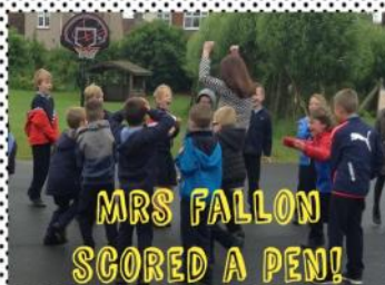
MRS FALLON SCORED A PEN!