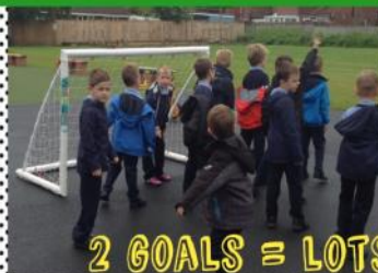
2 GOALS = LOTS OF HAPPY FACES